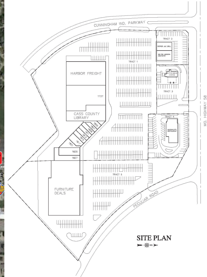
NORTH CASS CENTER BELTON, MISSOURI